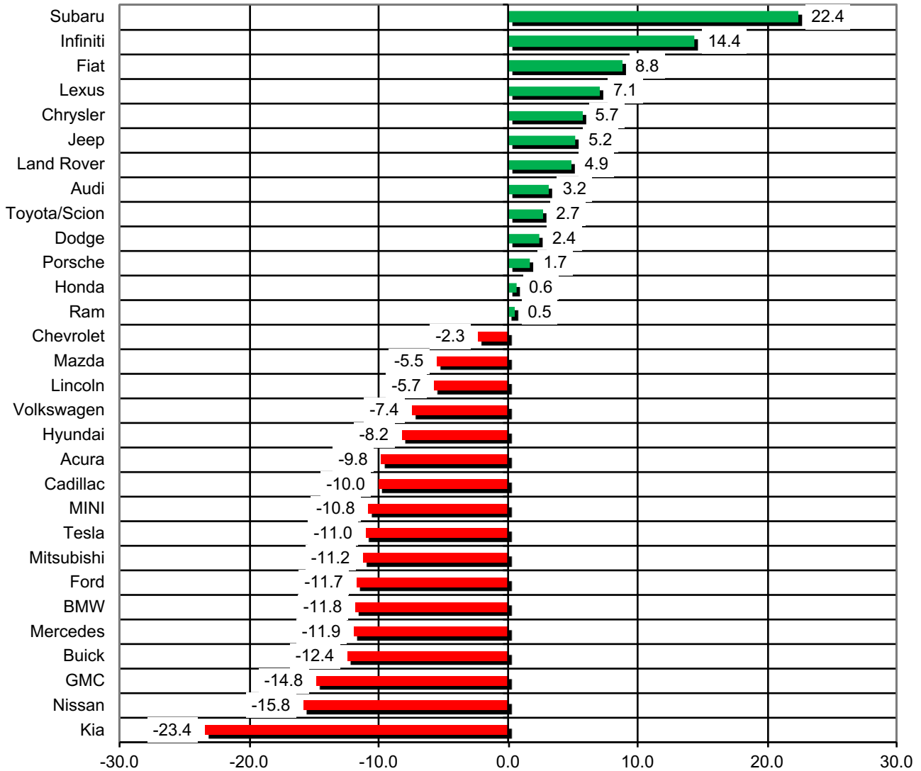
Percent change in registrations (YTD '17 vs. YTD '16)

Data Source: AutoCount data from Experian.